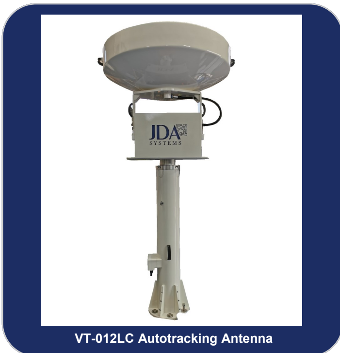
VT-012LC Autotracking Antenna

The VT-012LC is a dual axis 1.2m parabolic reflector autotracking antenna, it is self contained and is simple to setup and operate. The VT-012LC has a dual polarization head that can receive signals with gains of L band 22dBi, S band 26dBi, C band 32dBi and track using a digital rotary scan autotracking technique with continuous rotation in azimuth via slip ring assemblies with dual channel rotary joints.